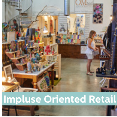
Impulse Oriented Retail