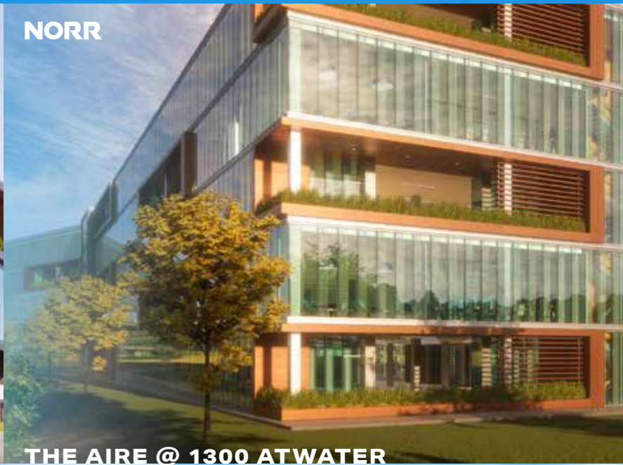
THE AIRE @ 1300 ATWATER