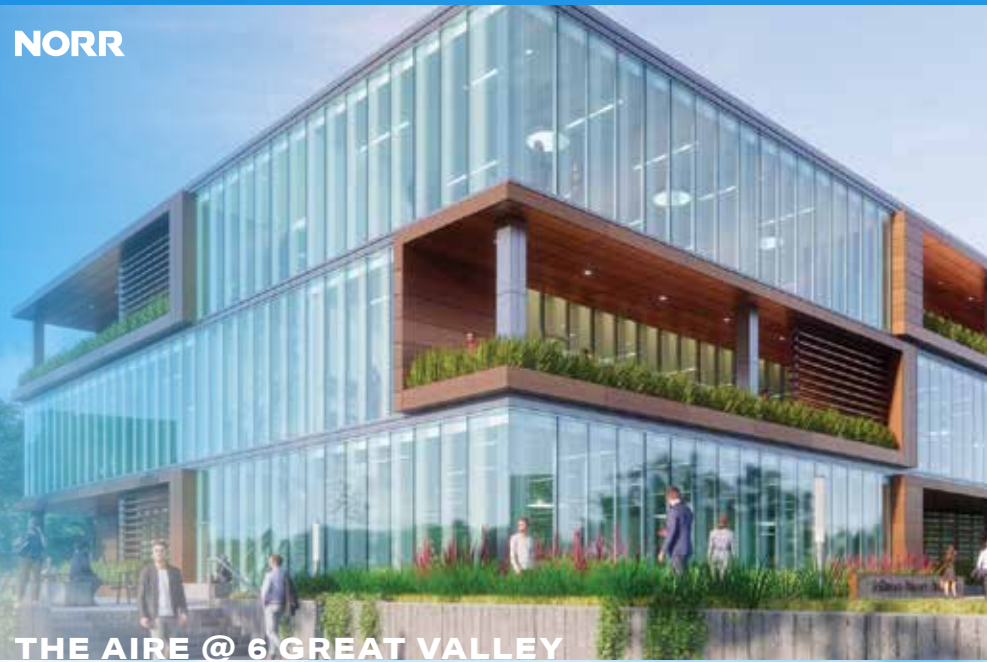
THE AIRE @ 6 GREAT VALLEY