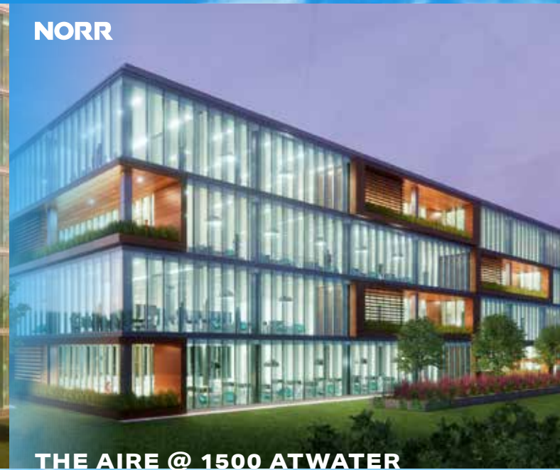
THE AIRE @ 1500 ATWATER

Discover the western suburbs new healthy building gold standard, THE AIRE . From the developers who built the first Platinum LEED certified Class A office building in PA, PSDC is bringing to the Malvern market +750,000 SF of the healthiest trophy offices in the region. THE AIRE has state-of-the-art building systems, lush indoor greenscaping and abundant natural light. THE AIRE will provide new healthy building standards and protocols such as state of the art HVAC with industry leading fresh air intake and filtration, enhanced janitorial protocols, touch free entry and common area access, individual tenant entry points with vertical stairway access and spacious private tenant balconies. THE AIRE fosters a first-class workplace environment that optimizes occupant health.