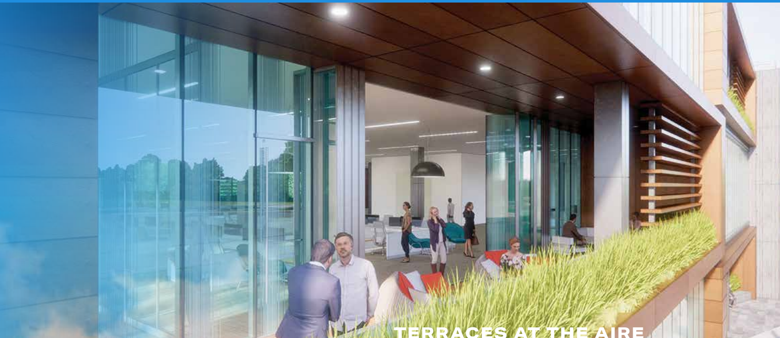
TERRACES AT THE AIRE

THE ANSWER: We understand the relationship between the physical environment and human health as it's more important now than ever before. PSDC has partnered with the highly respected NORESO consultants to create spaces that optimize occupant well-being and health with planned WELL v2™, Fitwell and RESET certifications.