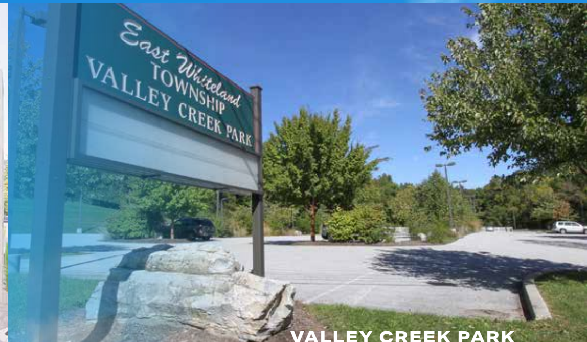
VALLEY CREEK PARK